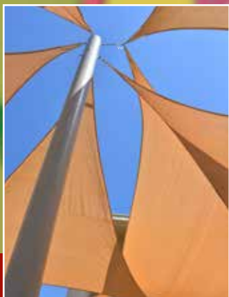
On the cover: The angular shade sails outside the Middle School.