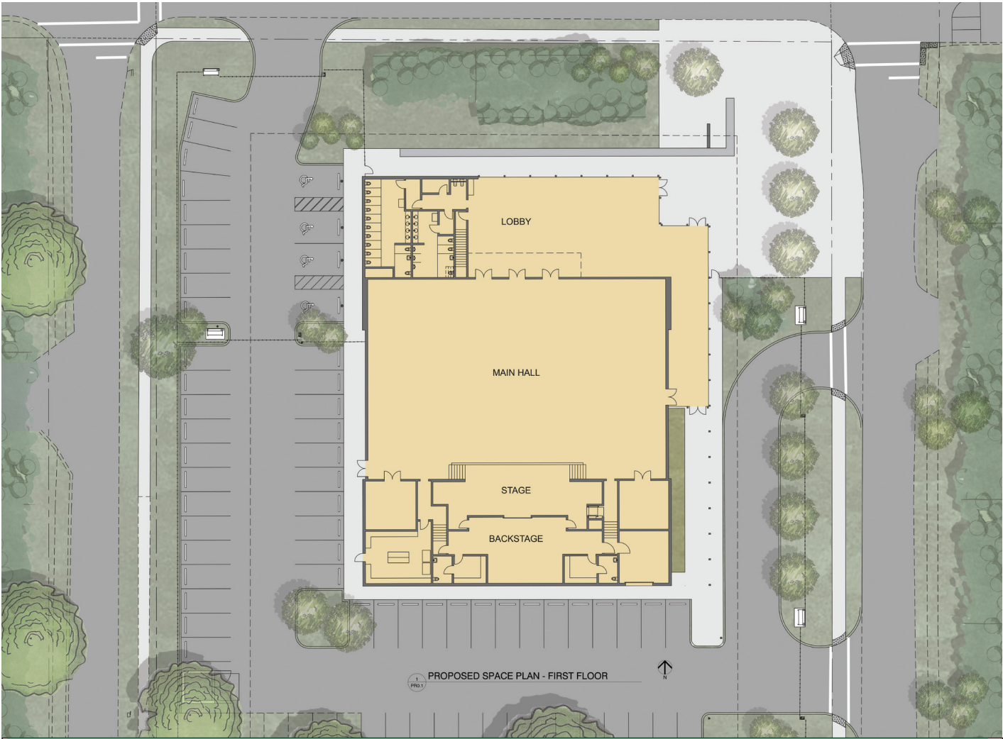
Architect: Hall Architects, PA | Contractor: Willis A Smith Construction