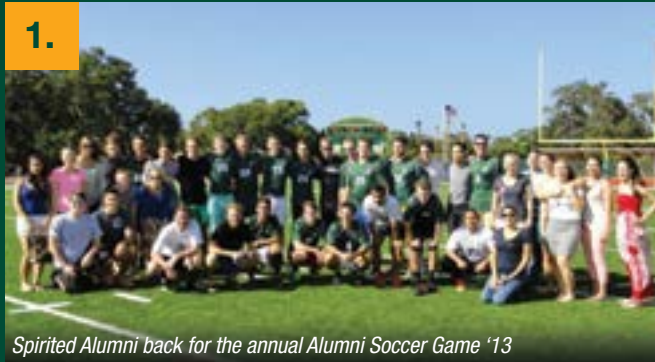
Spirited Alumni back for the annual Alumni Soccer Game '13