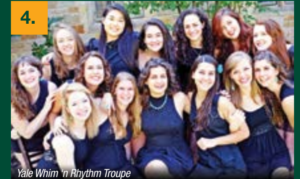
Yale Whim 'n Rhythm Troupe