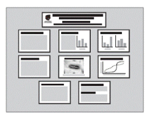
Figure 2: Panel method

The allocated poster area is divided up into a number of separate panels (Figure 2). These may consist of different elements such as text, pictures, tables or titles. Use a standard word-processor or presentation software (e.g. Word or Power Point)